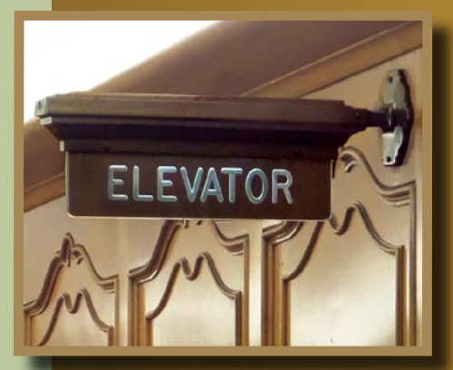
Thatcher Medical Center Pasadena, CA