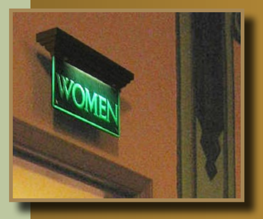
The Wiltern Theatre Los Angeles, CA

For more information on our custom capabilities, please contact your local Cole representative.