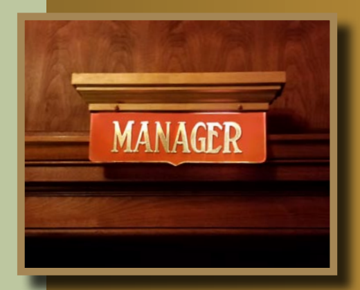
Catalina Casino Avalon, CA