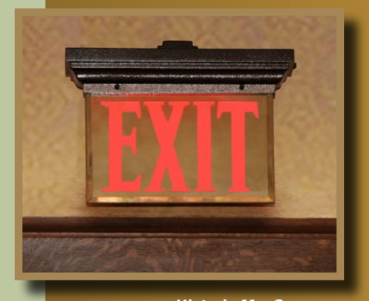
Historic MacGowan Residence Los Angeles, CA