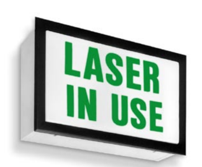
Custom color copy available as an option

The SL190/SL290 Series of signs offer clean styling in an popular size. The extruded aluminum housings feature a black polyester finish with copy on white snap-in panels. The wider SL190 Series is LED and available with an emergency battery backup system. The thinner SL290 Series offers a more sleek appearance. Either series may be specified for wet location installations. Many standard copy selections are available with custom options available upon request.