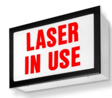
SL191 — Recessed