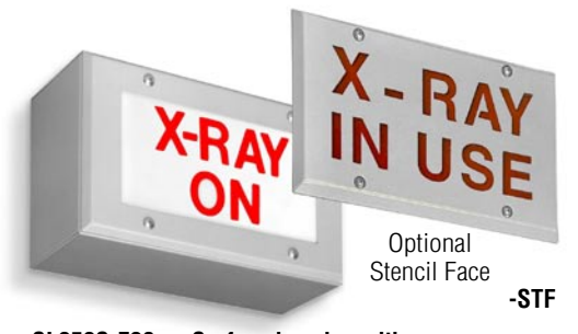
SL252S-E26 — Surface housing with LED lamp socket