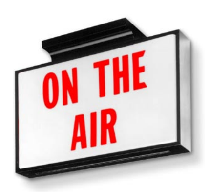
SL294 — Ceiling mount