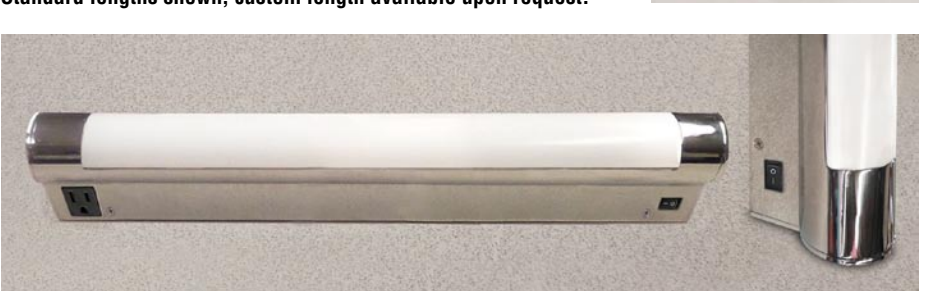
Options include convenience outlet and/or switch, with direct mount