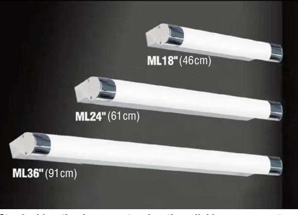
Standard lengths shown; custom length available upon request.

If your project demands a special fixture we would be pleased to discuss the design to suit your specific conditions. For more information on our custom capabilities, please contact your local Cole representative.