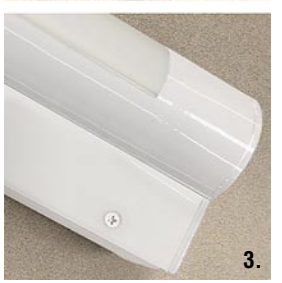
(1) Polished chrome plated is standard. Optional choices include, (2) satin nickel or a (3) white painted finish