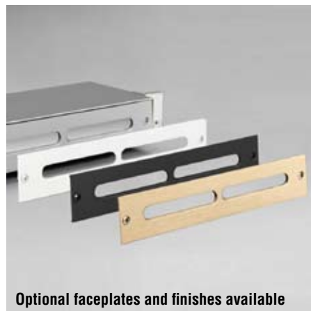
Optional faceplates and finishes available

High performance LEDs or wiring for a 20W T6 \frac{1}{2} incandescent intermediate base lamp are standard with this fixture.