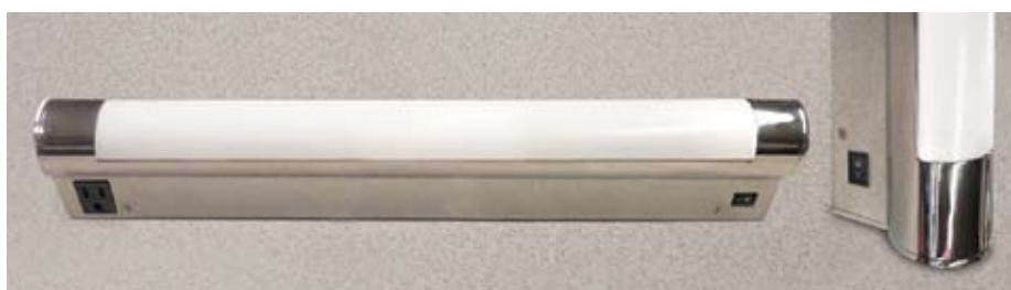
Options include convenience outlet and/or switch, with direct mount