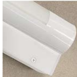
Brushed aluminum is standard. Optional choices include, polished chrome plated or white finish