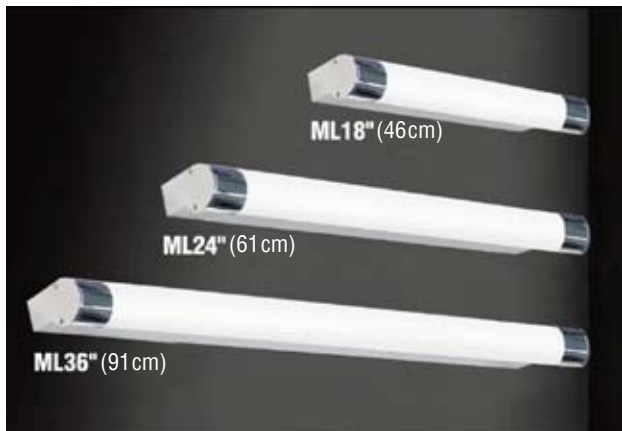
Standard lengths shown; custom length available upon request.