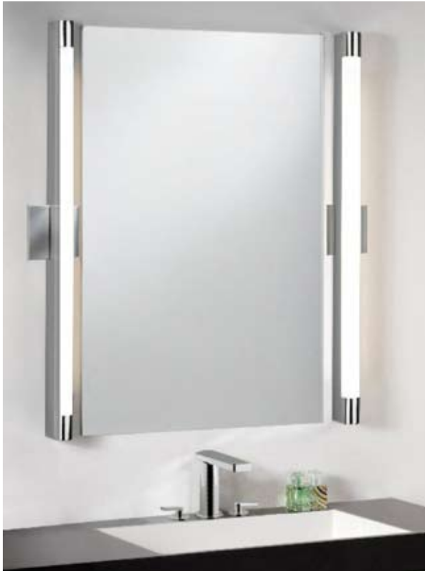
The Mirror Lite length and configuration may be varied to meet job requirements

If your project demands a special fixture we would be pleased to discuss the design to suit your specific conditions. For more information on our custom capabilities, please contact your local Cole representative.