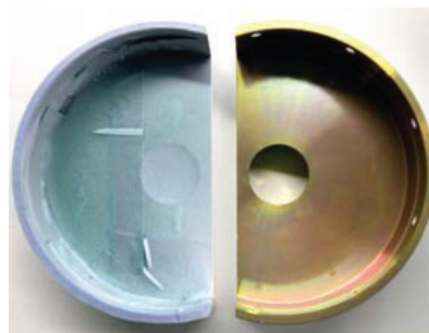
Chem film is sometimes applied to help masking adhere to a part before anodizing .

1401 GREENLEAF AVE. | ELK GROVE VILLAGE, IL 60007 | P. (847) 437 - 4488 F. (847) 437 - 4538