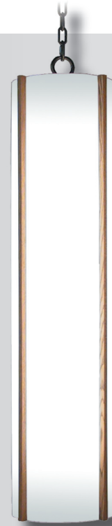
14" dia. W x 60"H (356 x 1524mm)

CH 170-6 illustrated with options: Downlight -DL Delete Wood Accents -DWA Stem Suspension -STM Finish Color -ABZ