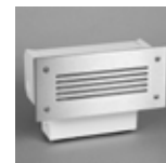
L158W-N-J Stainless Steel