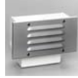
L252-N Stainless Steel 5-5/8" x 9-3/8"