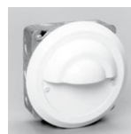
L150E 5-3/8" dia.