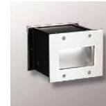
L603W-2S-N 4"x5" Thru-wall