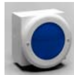
L150G/PA-BLU 5-3/8" dia.