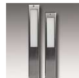
C1392W-LED-2 C1392W-LED Two sizes shown 14-3/16" x 2", 12-3/4" x 2"