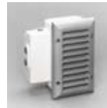
L252W-L26V-J 9-3/8" x 5-5/8"