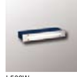
L506W 1-9/16" x 9-3/4"