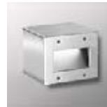
SL603W-N 4"x5" Surface. Also available in: L606-L609-L612 sizes