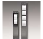
C1392D-LED-2 C1392D-LED-4 2 and 4 window 12-3/4" x 2", 16-5/8" x 2"