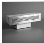
L2158W-N-J Stainless Steel