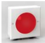
L150G-RED 5-3/8" sq.