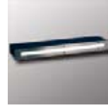
L512W 1-9/16" x 15-3/4"