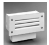
L158W-SCL-WHT-J Sharp Cut-off Louver