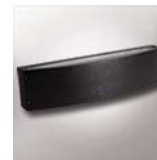
L2600W-2-ST/ST FannyPack XL