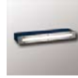
L509W 1-9/16" x 12-3/4"