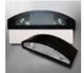
L2500W-1-EGR FannyPack Egress