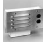
L252-N-CO-J 5-7/8" x 11-5/8"