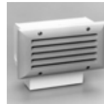
L252W-L26-J 5-5/8" x 9-3/8"