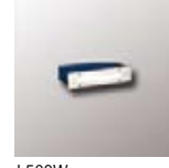
L503W 1-9/16" x 6-3/4"